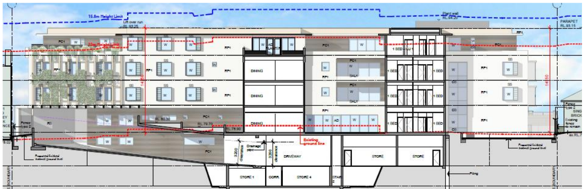
Figure 3: Extract from DA10 Rev C - Section H (red dashed line represents the 12m Height of Building control relative to existing ground level)